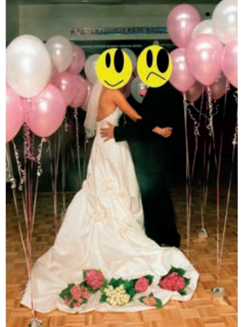
Fairytale for Sale 2011-2013