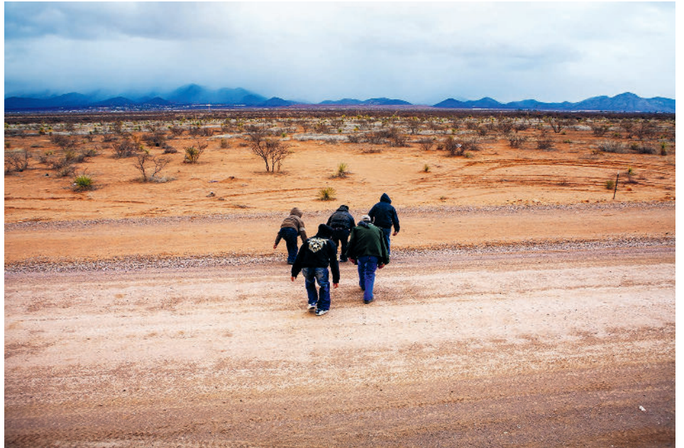
Migrants crossing the border on the US side.